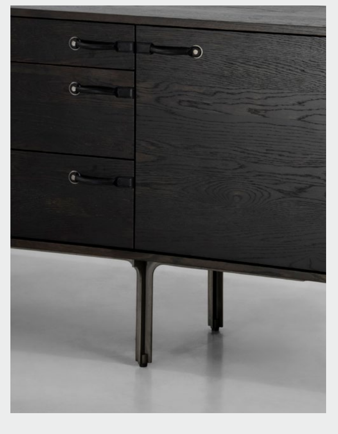
Oak frame / Antique nickel / Leather handles

Tote is a collection of cabinets, credenzas, dressers and tallboys, streamlined in form and function, with drawers and/or doors crafted in District Eight's signature materials of oak. Subtlety for details is highlighted upon the evenly contrasted steel legs, while the highlight awaits in Tote's hand-crafted handles – outfitted in high-quality leather, they provide tactile pleasure and warmth upon touch.