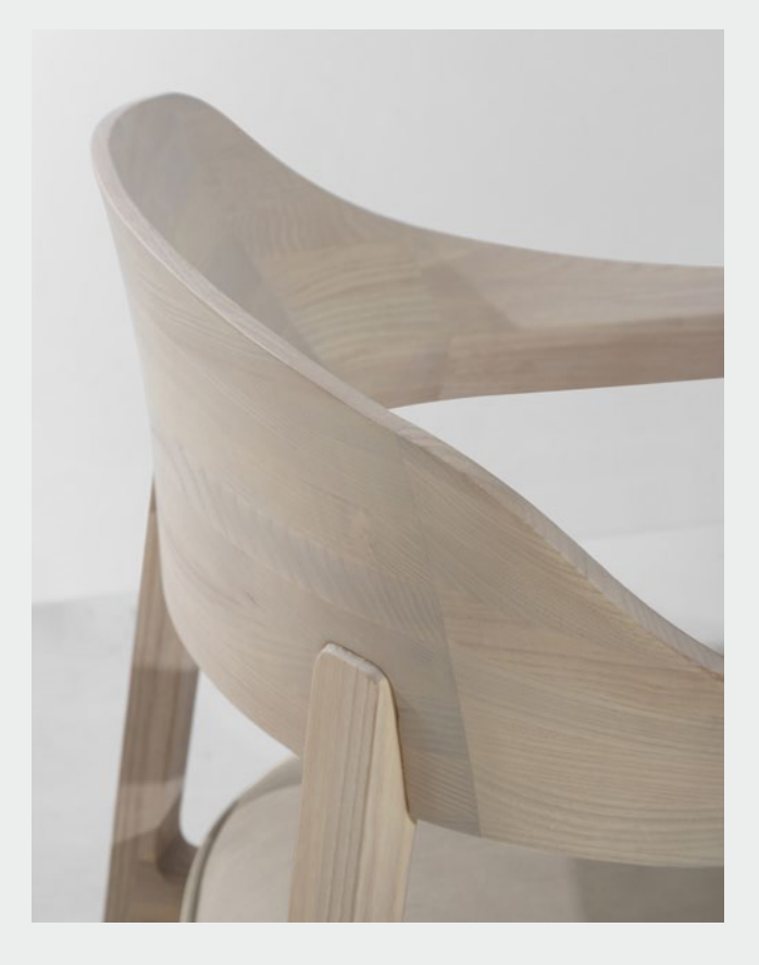
Ash frame / Upholstered seat

Colette Chair offers an abstract reference to the Vietnamese traditional script and a love letter to the craftsmanship of timber. Its sweeping backrest forms a collar that's instantly distinctive and inviting. Extended to ridges of the armrests and their rounded ends, the frame provides ample support for ease and comfort, lending the collection a level of formality and sophistication in any space.