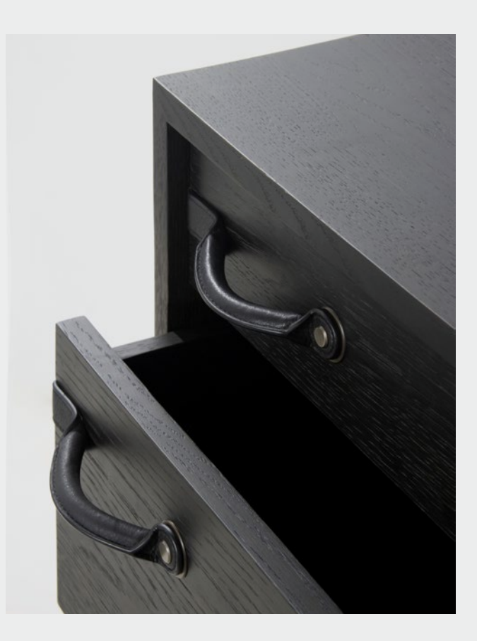
Oak frame / Antique nickel / Leather handles

Tote is a collection of cabinets, credenzas, dressers and tallboys, streamlined in form and function, with drawers and/or doors crafted in District Eight's signature materials of oak. Subtlety for details is highlighted upon the evenly contrasted steel legs, while the highlight awaits in Tote's hand-crafted handles – outfitted in high-quality leather, they provide tactile pleasure and warmth upon touch.