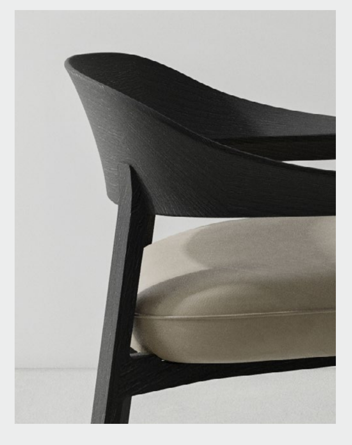
Ash frame / Upholstered seat

Colette Chair offers an abstract reference to the Vietnamese traditional script and a love letter to the craftsmanship of timber. Its sweeping backrest forms a collar that's instantly distinctive and inviting. Extended to ridges of the armrests and their rounded ends, the frame provides ample support for ease and comfort, lending the collection a level of formality and sophistication in any space.