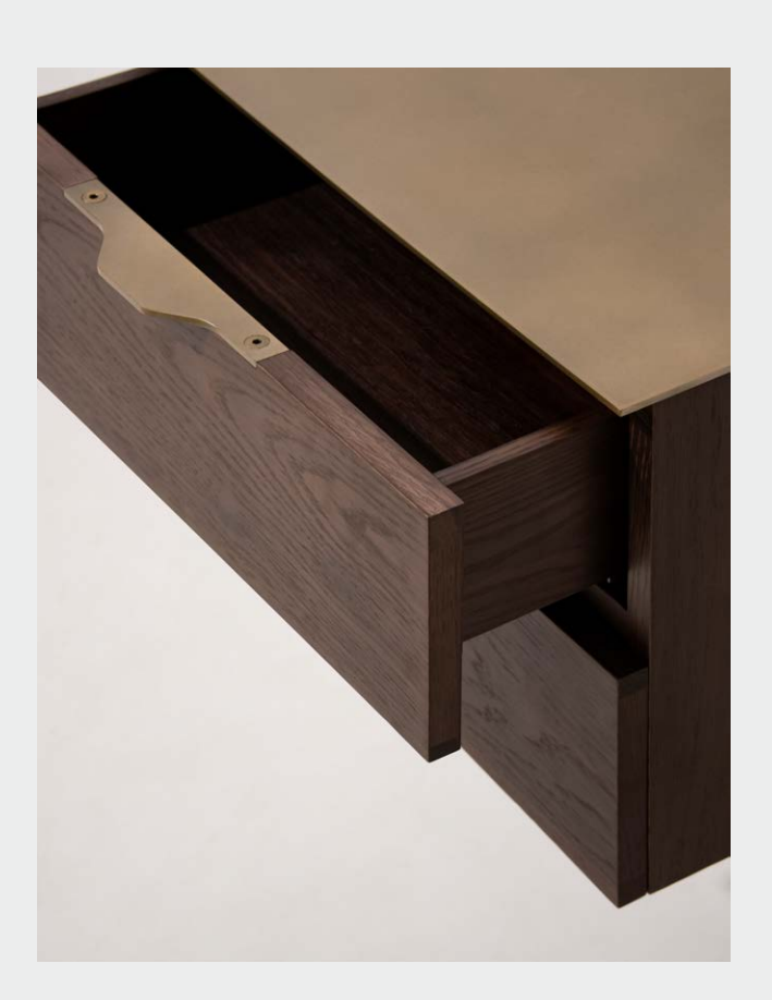
Oak frame / Antique brass steel top, drawer pulls & wall-mount

The Drift storage collection includes shelves, cabinets and drawers to create a functional wall system that allows to organise home & office. All are made from oak veneer and oak, with steel tops and hand-crafted brass drawer pulls.